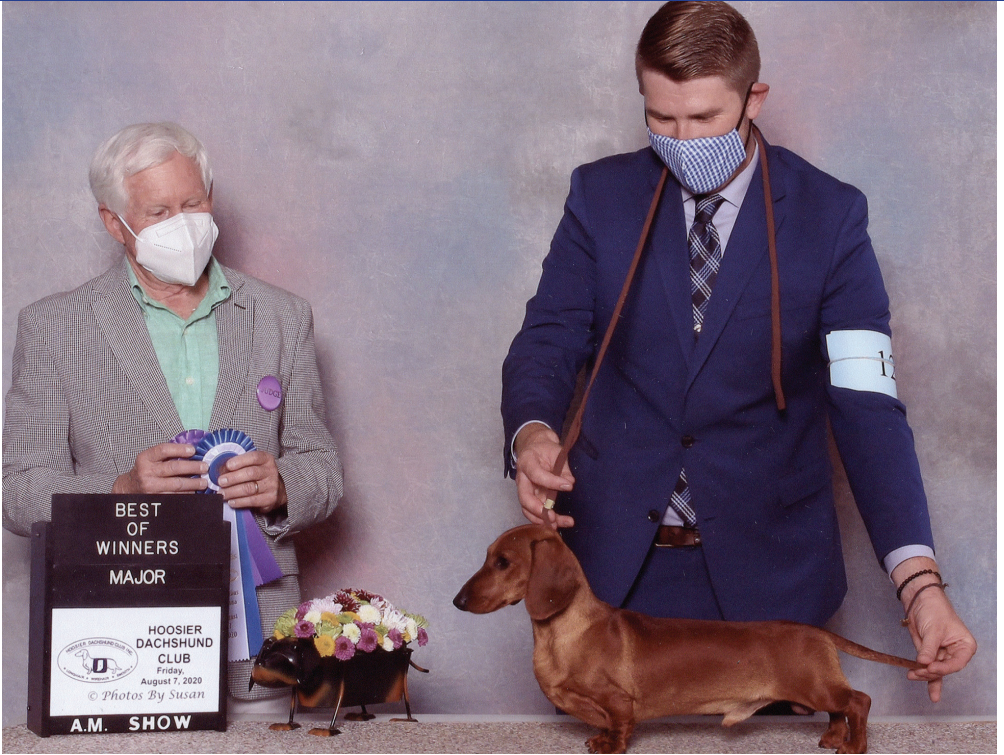
Minidogland Mr Choco x Zimerbude Duna

GCHB Minidogland Rammstein. Top Russian import. Proven producer, with several litters on the ground. Watch for his outstanding show-progeny in 2022/2023. Began showing at 13 months. GCHB at 16 months. BOS at 2020 Royal Canin Nationals. Select winner at 2020 Royal Canin Dachshund Specialty.