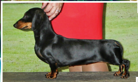
CH Blueprint You'll See MS