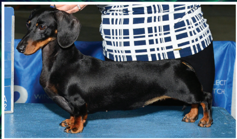
ABS DC Blueprint Passion For Fashion MS, TKN