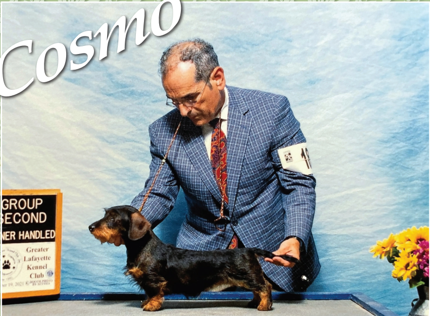
Summer Hill Wire Me Magic at Sandeckel (GCHB CH Summer Hill King Mai Tai x CH Sandeckel's Social Graces)

Return address: 409 S. Webster Avenue, Indianapolis, IN 46219