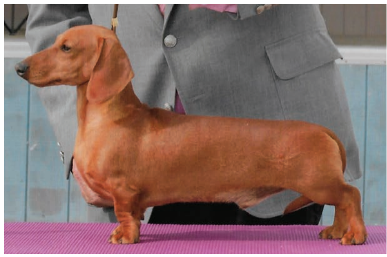
UKC/AKC Champion Sandar's Stryker MS (Ch Criscross Obsidian MS x Ch Sandar's Reba of Sagerun MS)