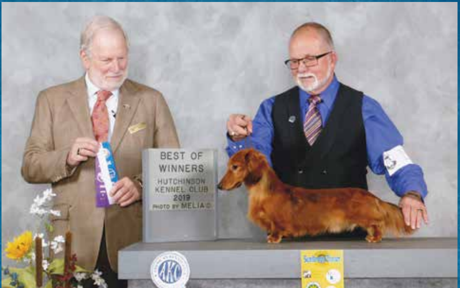
CH Aubray's Elfin Golden Boy x CH Aubray's Soul Stealer at Roserock