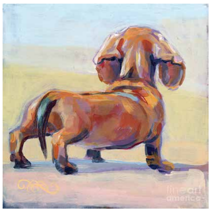
National Purebred Dog Day* nationalpurebreddogday.com

The Dachshund has to be one of our favorite breeds to use as an illustration of form following function, and with this post, we touch upon the breed's chest.